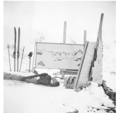
Studio in the snow, Bernina Pass 1908