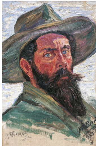
Self-portrait with hat, 1913 oil on canvas (27 x 41 cm)