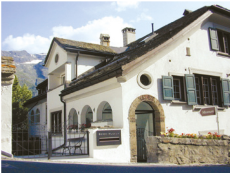
Villa Arona, St. Moritz